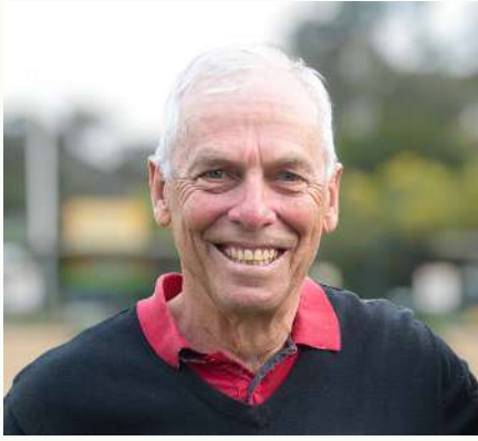
Mal Shield Front Green Conversion Coordinator

The plan is for the grass green to be replaced after the end of the pennant season. There may be some work on the lighting before then as it should be of a short duration and needs to be done before installing the green.