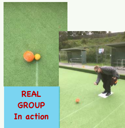
REAL GROUP In action