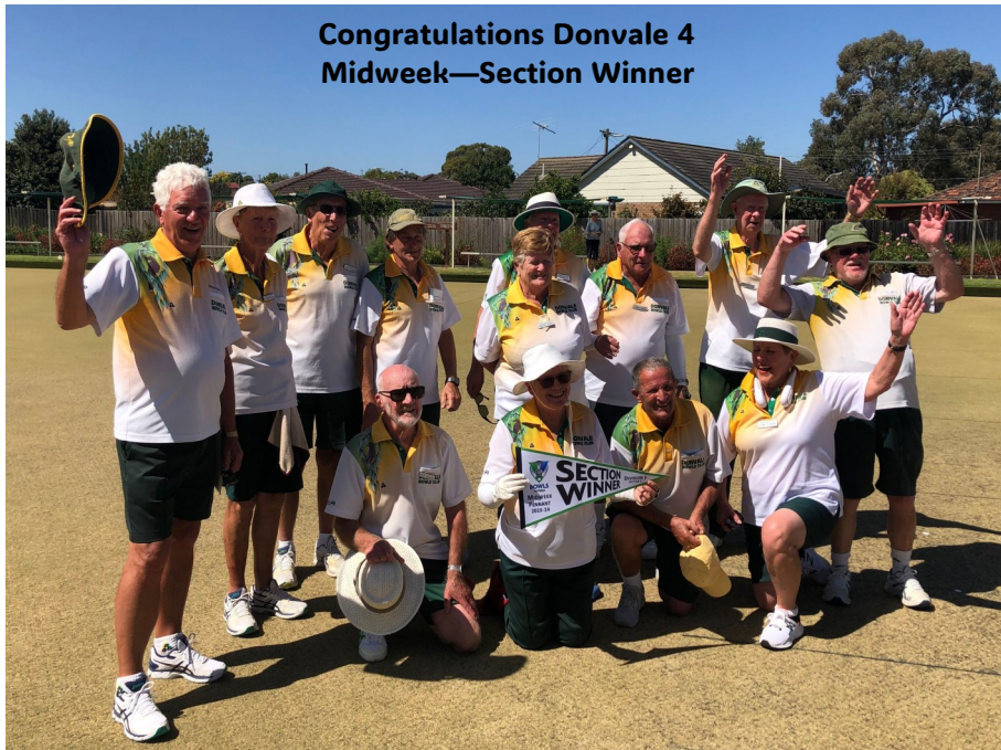
Congratulations Donvale 4 Midweek—Section Winner