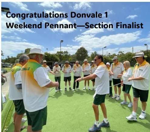
Congratulations Donvale 1 Weekend Pennant—Section Finalist

Congratulations Donvale 4 Weekend Pennant— Section Finalist