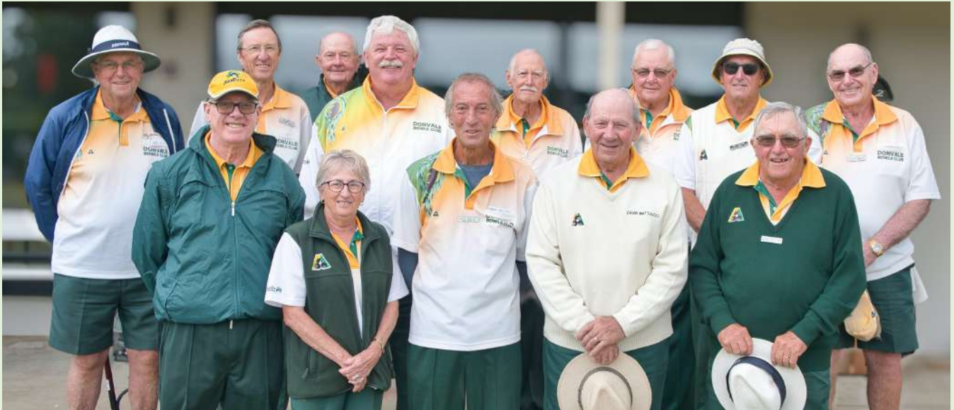
Donvale 1 vs Whittlesea 1 – at Whittlesea and WON