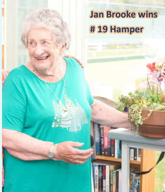
The "Crew" involved with the Raffle Hamper Presentation