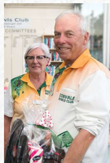
Mal Shield Hamper 6 Winner